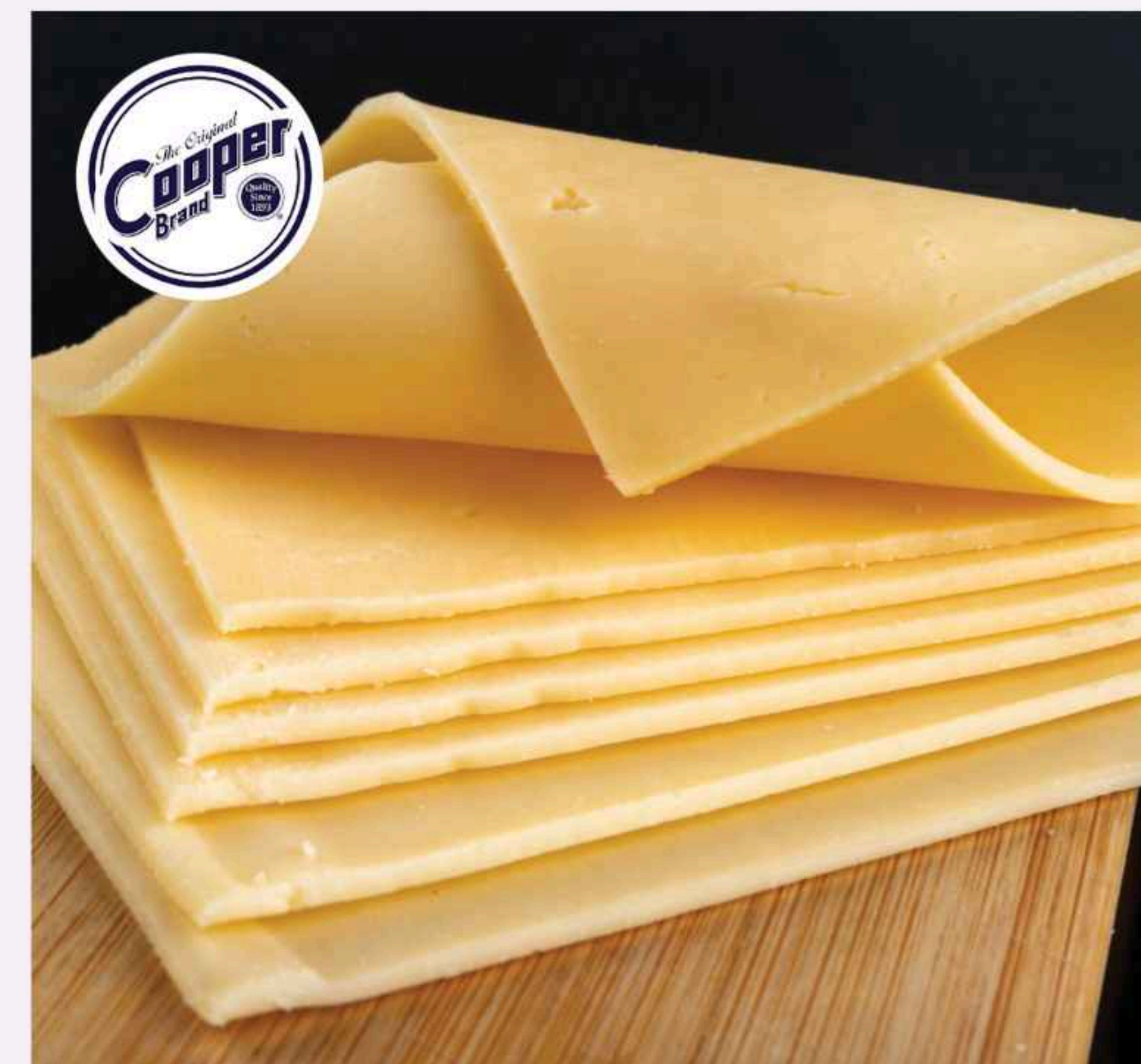
Deli Sliced Cooper Mellow Sharp Cheese