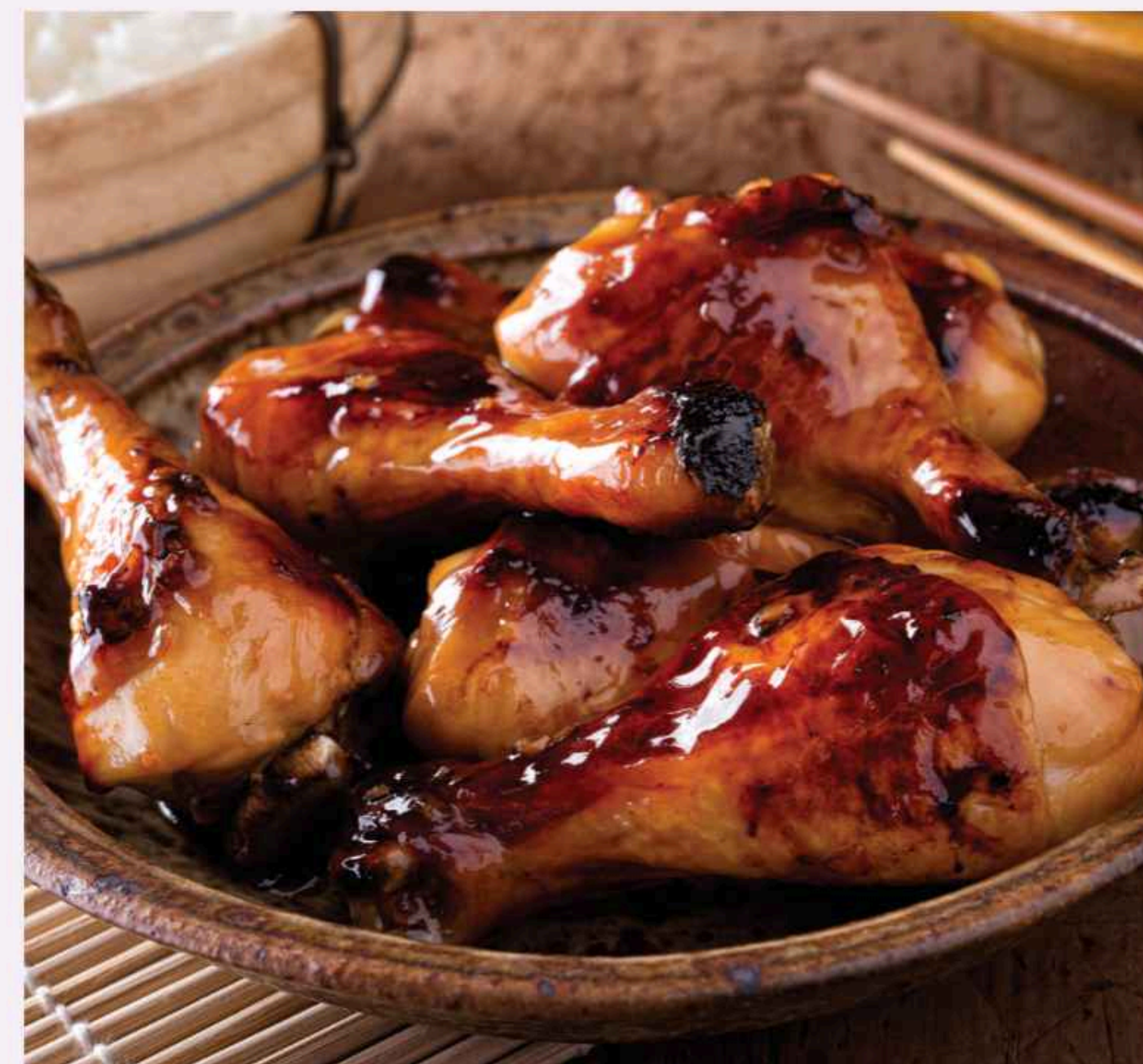
Fresh Chicken Drumsticks