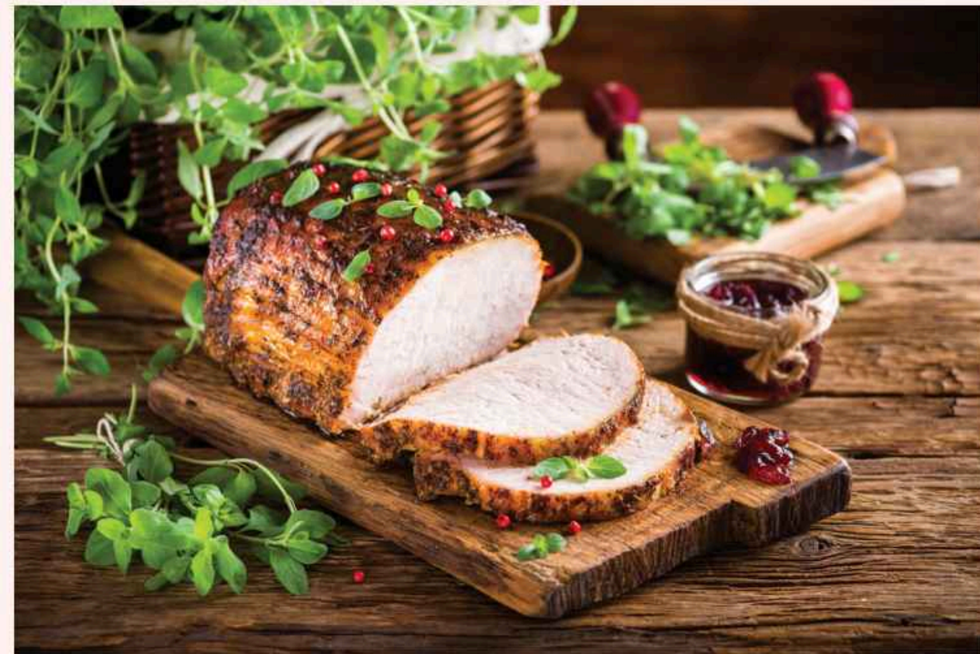
Fresh Boneless Pork Sirloin Roast