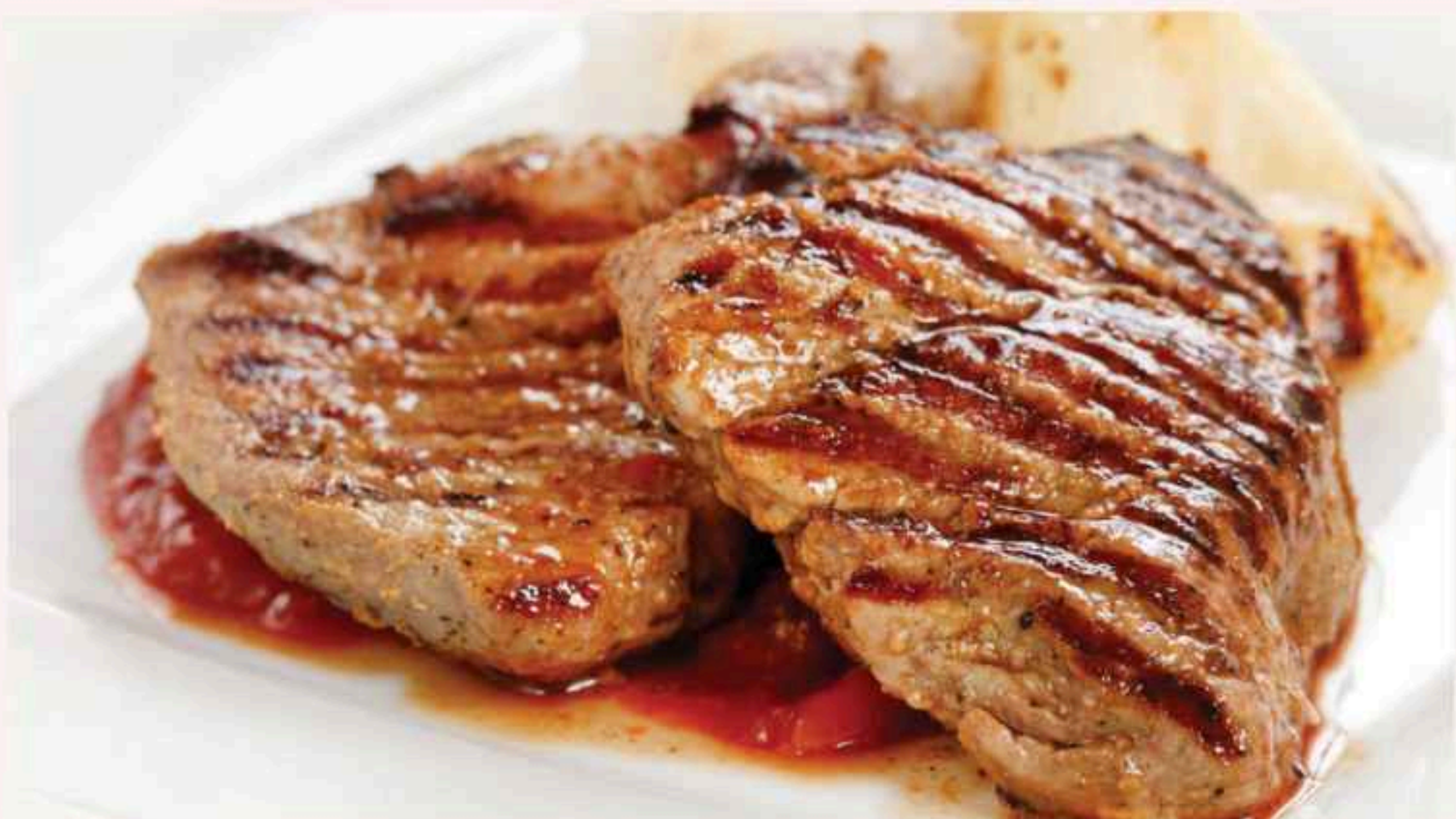
Fresh Boneless Pork Sirloin Cutlets