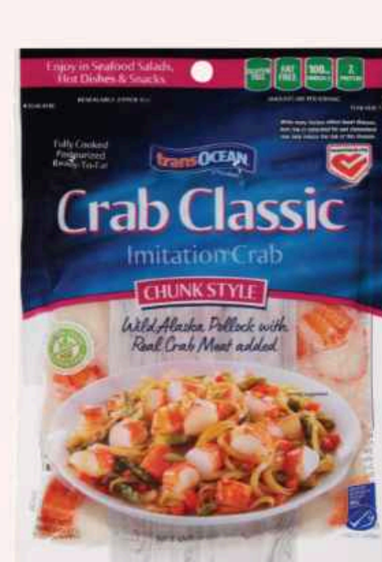
8 oz. Pkg. TransOcean Imitation Crab