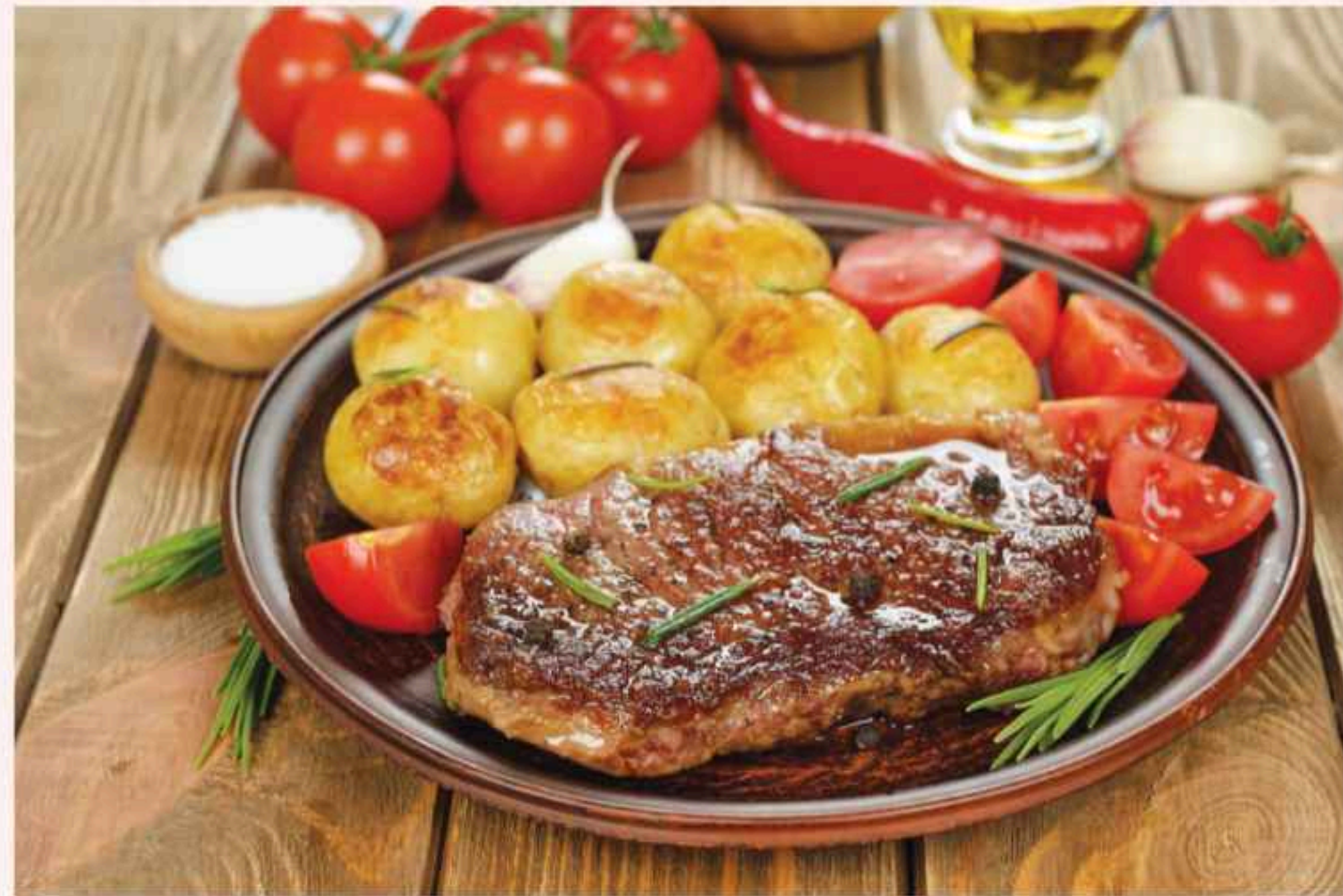
USDA Choice Beef - Family Pack Boneless Chuck Steak