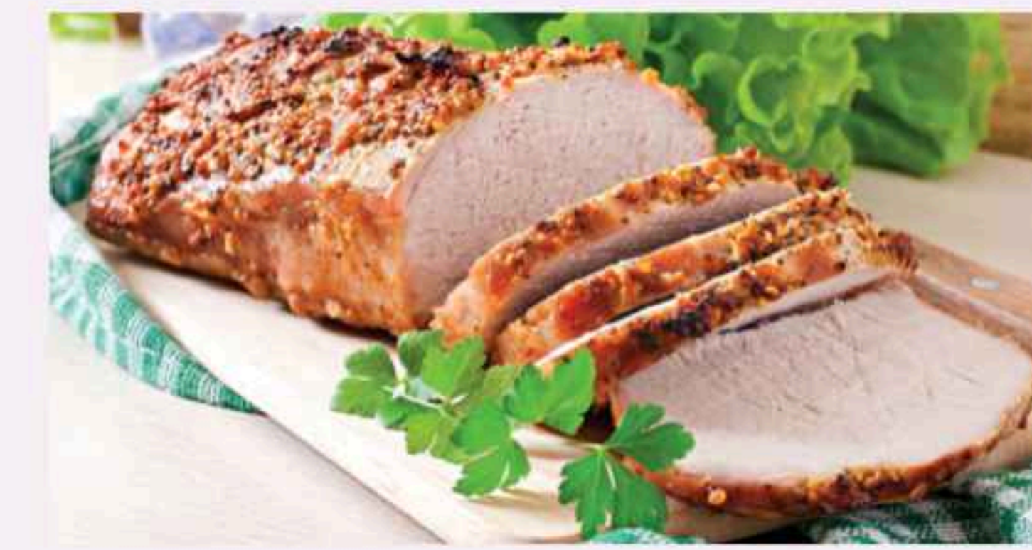
Fresh Boneless Center Cut Pork Roast