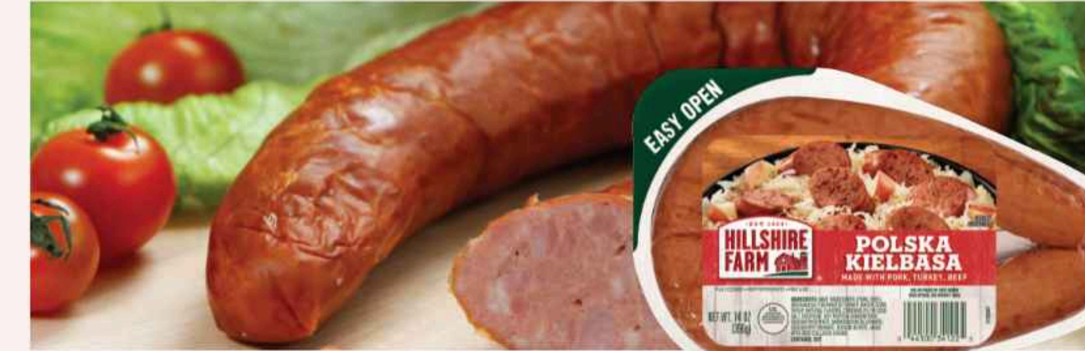
12-14 oz. Pkg. Hillshire Farm Kielbasa