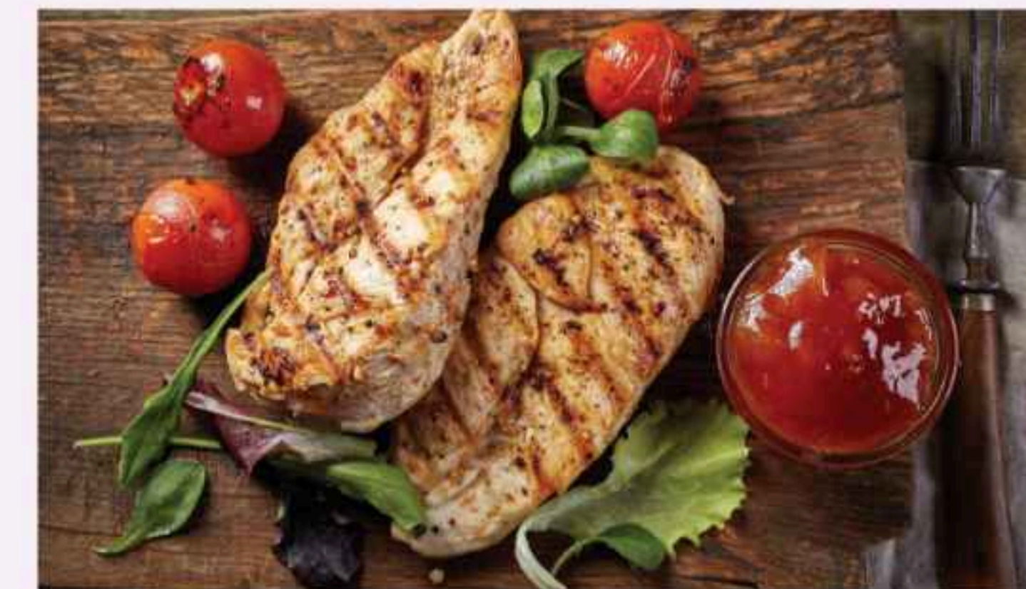
Jumbo Boneless Chicken Breast