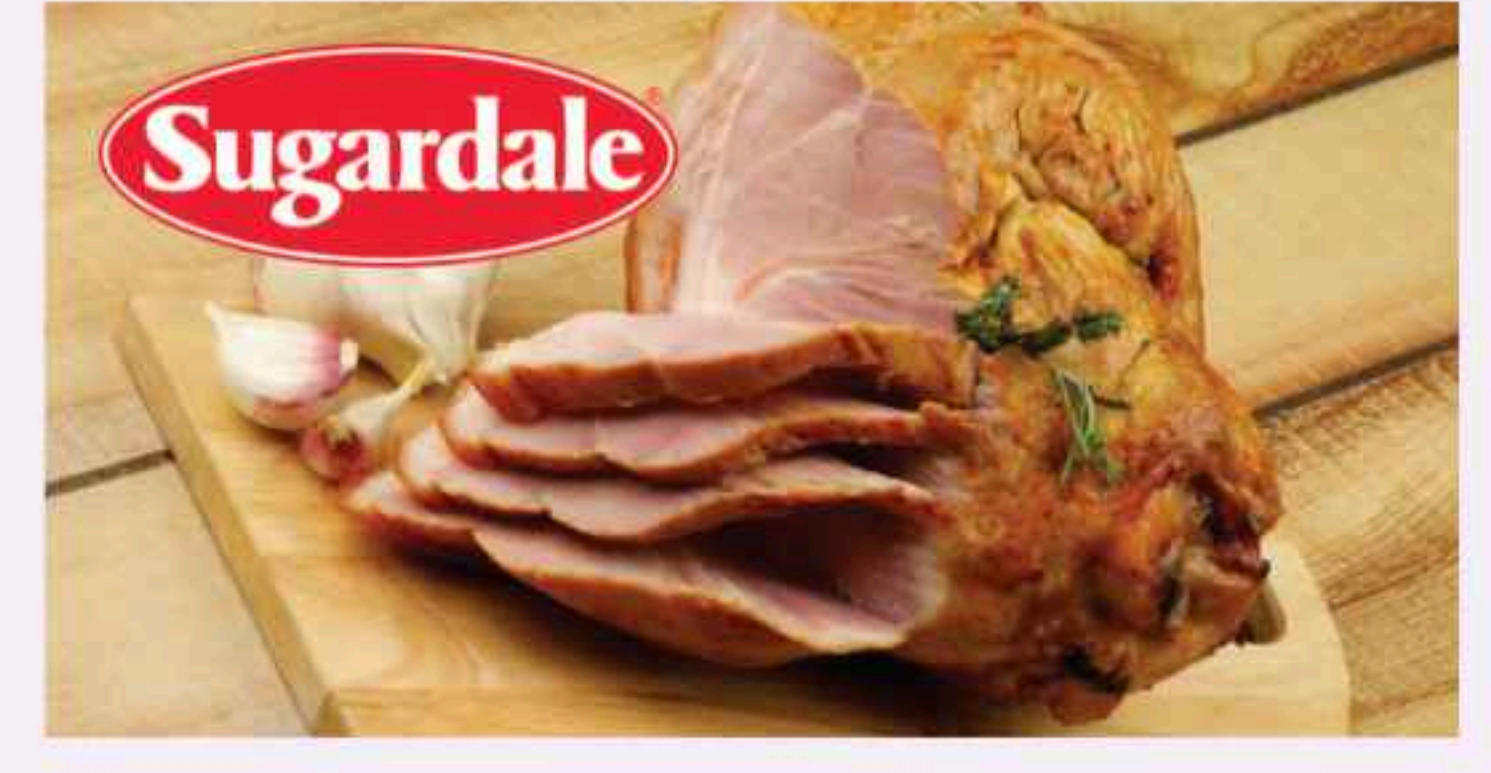
Shank or Butt Portion Sugardale Hams