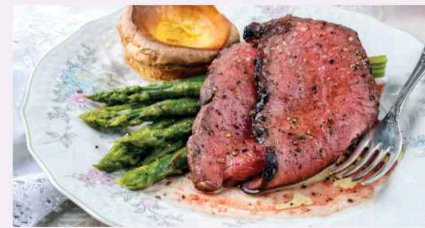
USDA Select Beef Boneless Top Round Roast