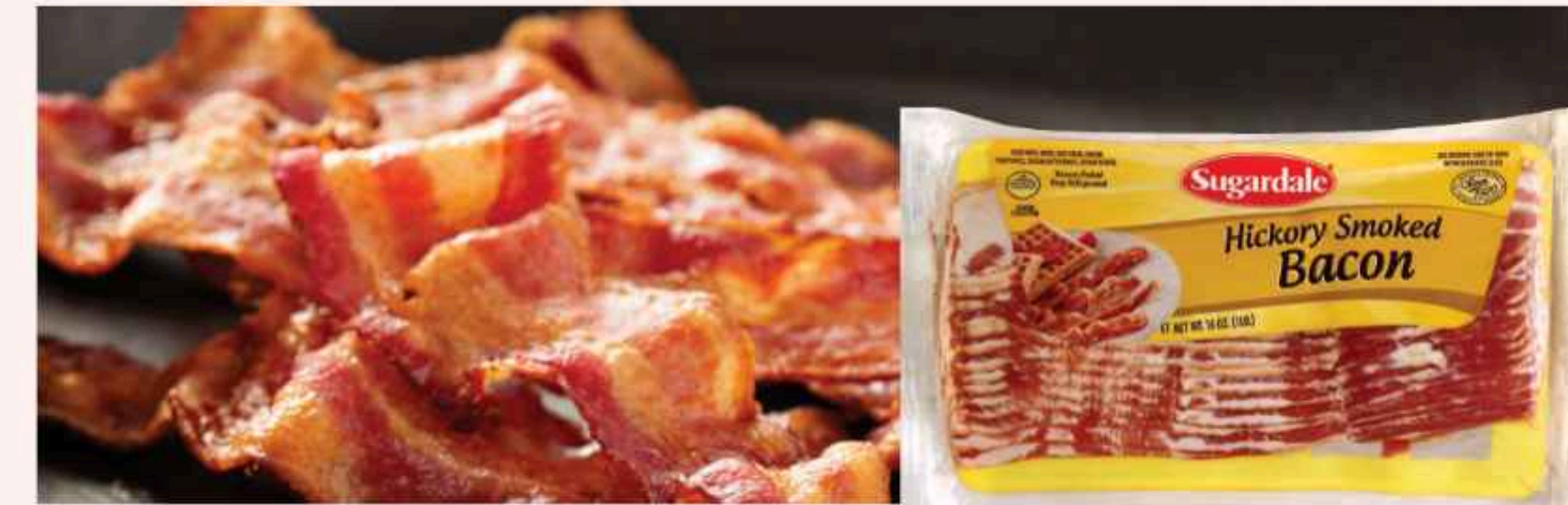
16 oz. Pkg. Sugardale Sliced Bacon