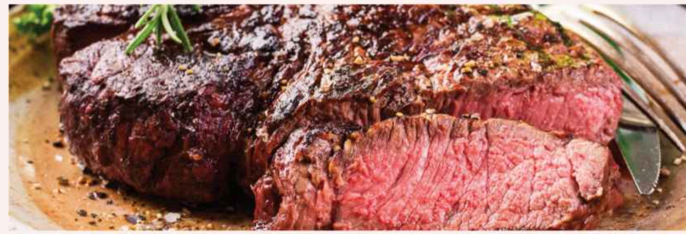
USDA Select Beef Boneless Top Round Steak