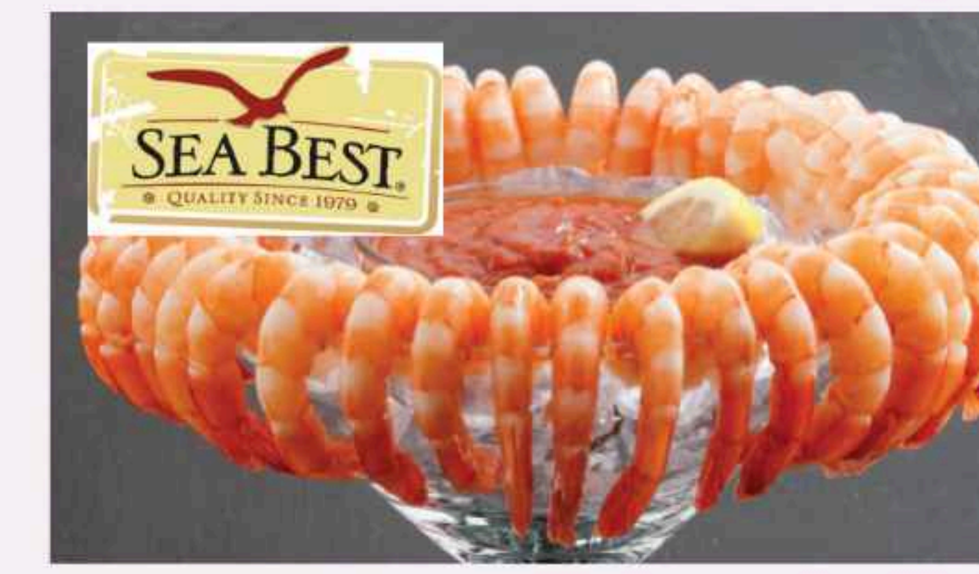
Frozen-10 oz. Pkg. 60/80 ct. Sea Best Shrimp Ring