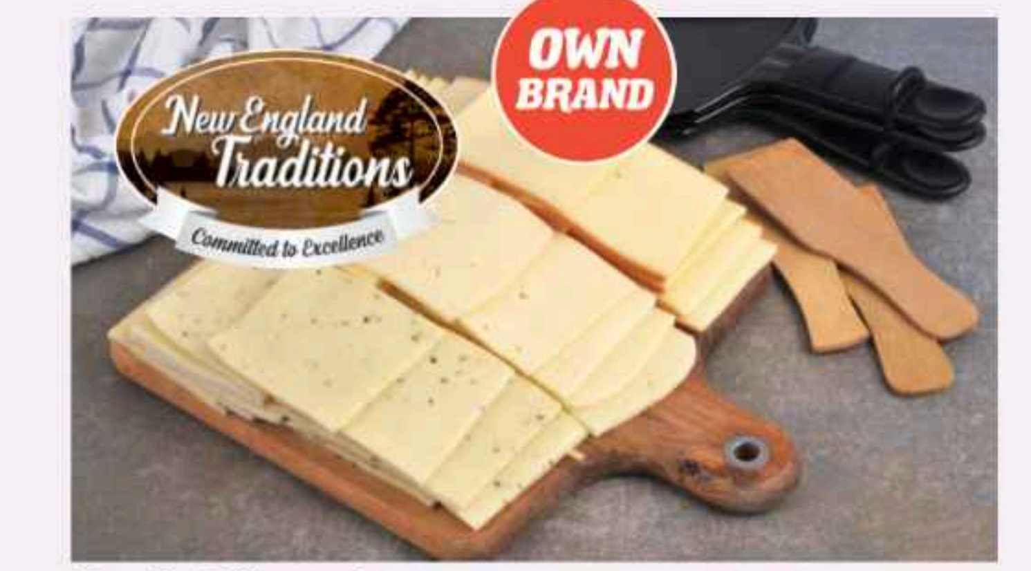
Deli Sliced New England Traditions Pepper Jack Cheese