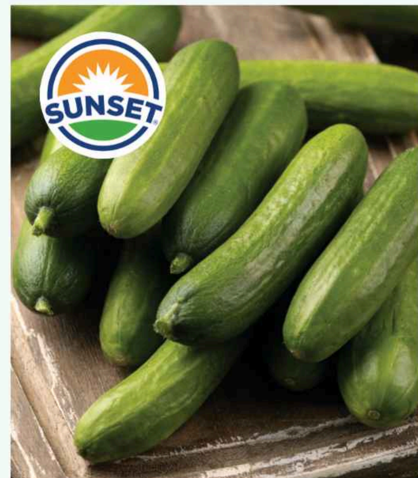
12 oz. Pkg. Seedless Sunset Mini Cucumbers