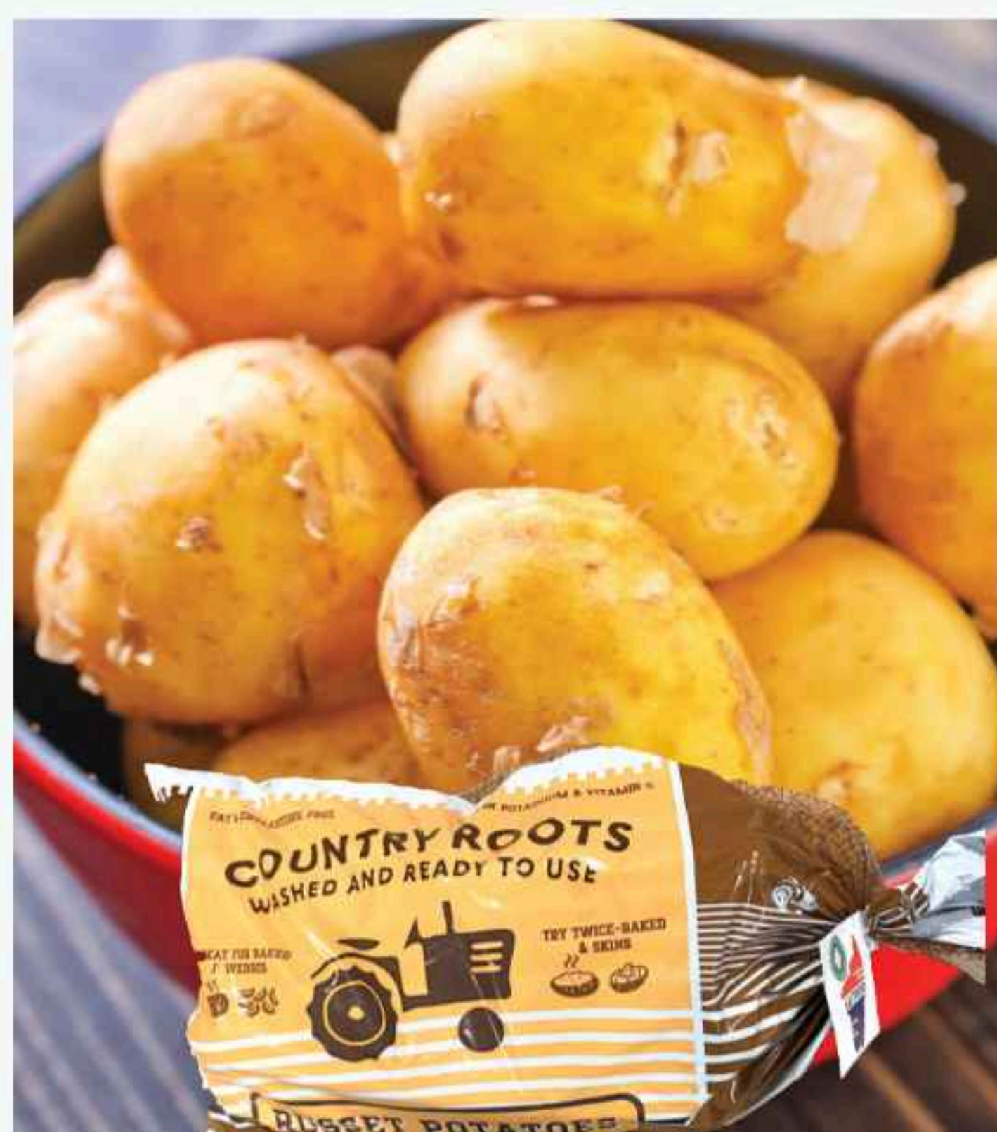
10 lb. Bag - Maine Country Roots White Potatoes