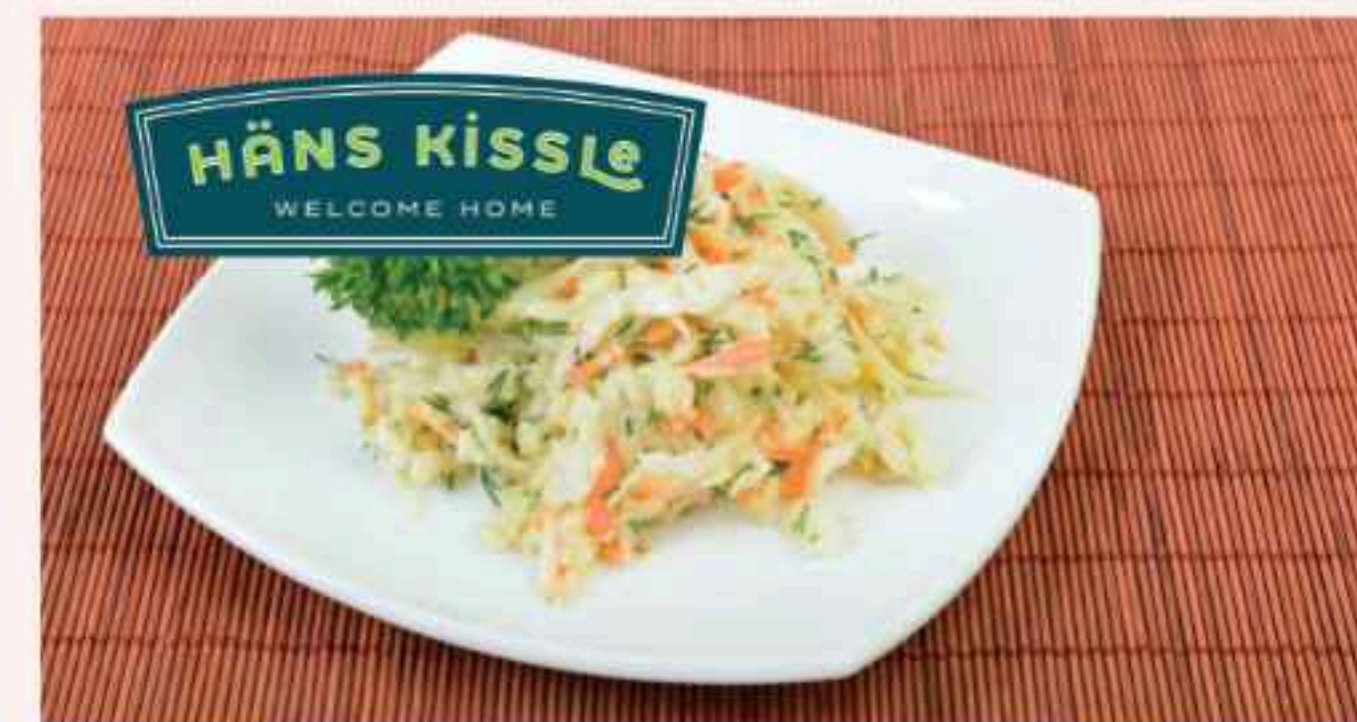
Häns Kissle Cole Slaw