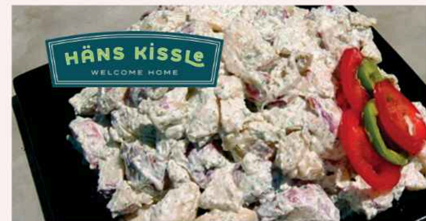
Häns Kissle Red Bliss Potato Salad