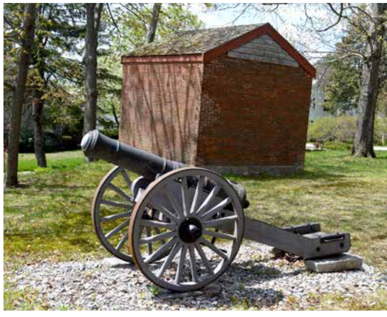
The Hallowell Powder House is positioned high above the city and the Kennebec River on High Street.

in the construction of a powder house on a lofty hill overlooking the Kennebec River, the water route an invader would be likely to sow chaos in central Maine.