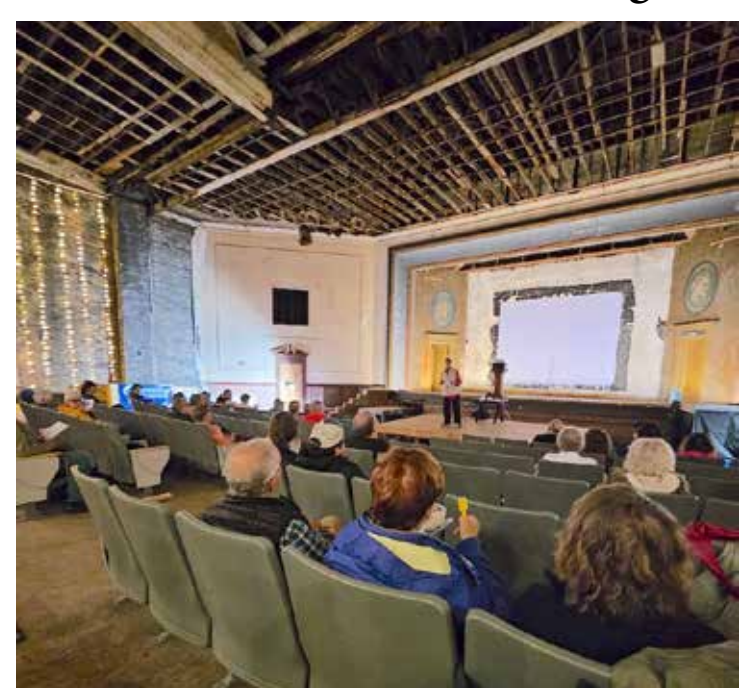
The audience hears an introduction to one of the films presented during a two-day film festival at the Colonial Theater in Augusta.

In the early 20th century, when the movie business in Hollywood was still in its infancy, Augusta briefly flourished as an East Coast version of Tinseltown. Several silent movies were shot in and around the city, and their premieres took place at the nearly new Colonial Theater on Water Street in Augusta.