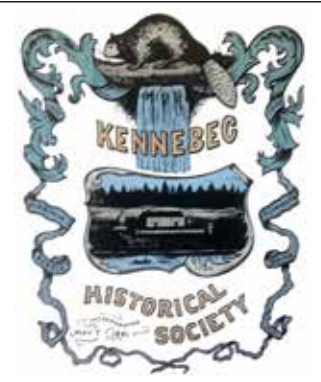
Discovering, preserving, and disseminating the history of Kennebec County, Maine, since 1891

J.S. McCarthy Printing Meadow Park Development O'Connor GMC