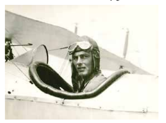
World War I aviator Erlon H. Parker, from Farmington, didn't leave his home base without a couple of homing pigeons.

For 75 years, through four wars on four continents, these 1-pound birds were the military's most reliable means of communication, carrying messages in and out of environments teeming with gas, smoke, exploding bombs, and gunfire. They flew through jungles and across deserts, mountains, and large expanses of ocean. Sometimes they arrived at their lofts nearly dead from wounds or exhaustion, but they got their messages through.