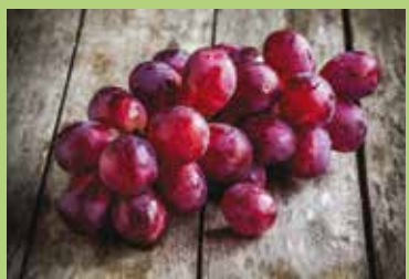
Chilean Extra Large Seedless Red Grapes ..... $2.29 lb.