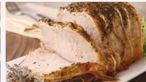
Fresh Boneless Pork Roast ..... $1.99 lb.