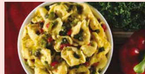
Delicious! Hans Kisse Cheese Tortellini Salad ..... $4.99 lb.