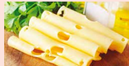
Deli Sliced Imported Finlandia Swiss Cheese ..... $5.99 lb.