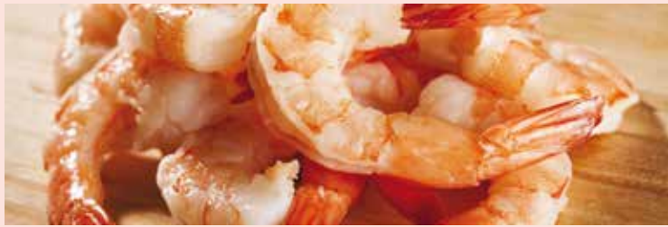
1 lb. Pkg. 26-30 ct. Frozen, Easy Peel, Raw Sea Best Shrimp ..... $7.49