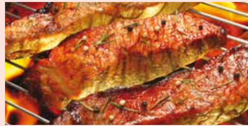
Boneless Country Style Spareribs ..... $1.99 lb.