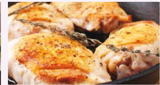
Fresh Chicken Thighs ..... 99¢ lb.