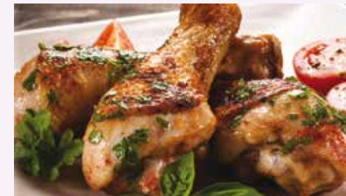
Fresh Chicken Drumsticks ..... 79¢ lb.