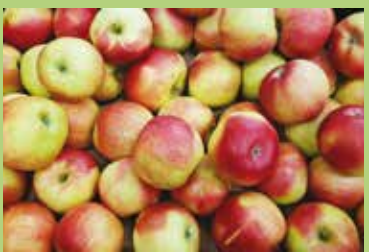
3 lb. Pkg. New York McIntosh Apples . $2.79