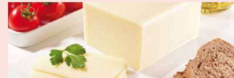
8 oz. Pkg. Cabot Deli Cheddar Bars ..... $3.99