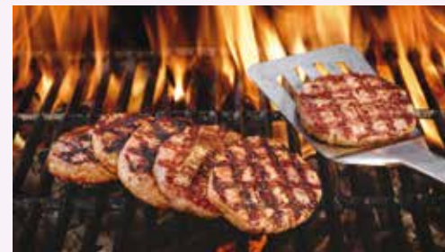
Family Pack Fresh Ground Round ..... $3.49 lb.