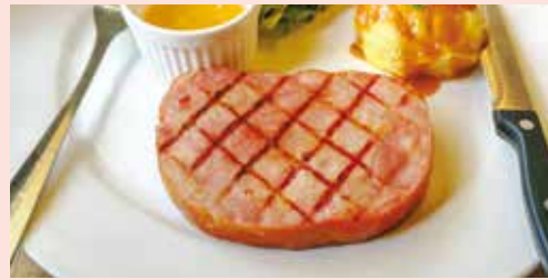
7-8 oz. Pkg. Hatfield Ham Steaks ..... $2.49