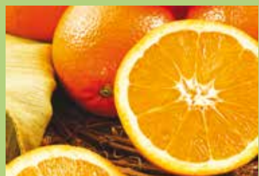
California Navel Oranges ..... 99¢ ea