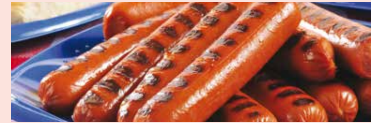
14 oz. Pkg. Kayem or Fenway Meat Franks ..... $3.49