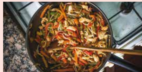
24-28 oz. Pkg. Gourmet Dining Complete Skillet Meals ..... $4.99