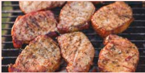
Family Pack Boneless Pork Chops ..... $2.49 lb.