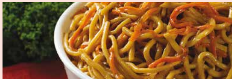
Tasty! Hans Kisse Oriental Noodle Salad ..... $3.99 lb.