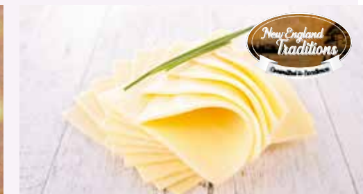
Deli Sliced New England Traditions White American Cheese ..... $3.99 lb.