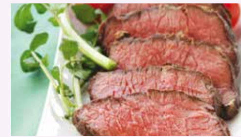
USDA Select Beef Boneless Top Round Roast..... $279 lb.