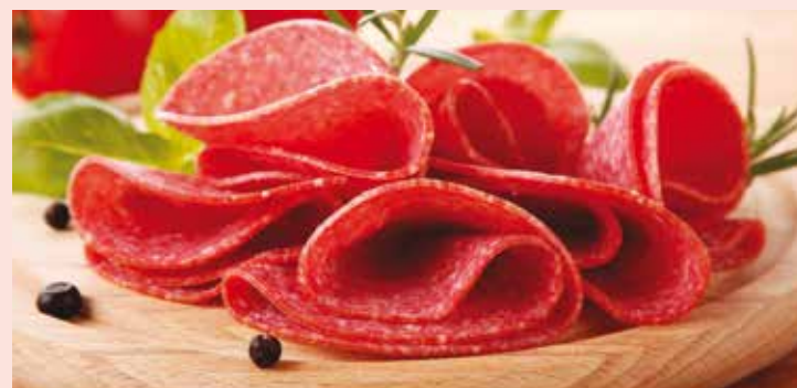
8 oz. Pkg. Sugardale Sliced Pepperoni ..... $199