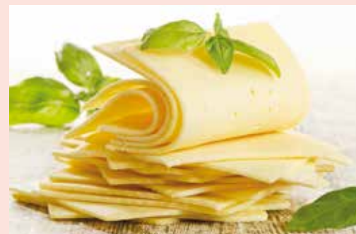
Deli Sliced, Sharp Cabot Cheddar Cheese..... $699 lb.