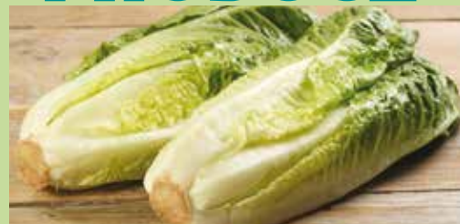
3 ct. Pkg. Fresh Express Romaine Hearts..... $229