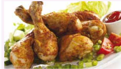
Family Pack Fresh Chicken Drumsticks..... 69¢ lb.