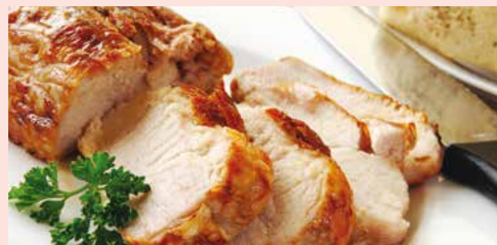
Boneless Pork Sirloin Roast..... $159 lb.