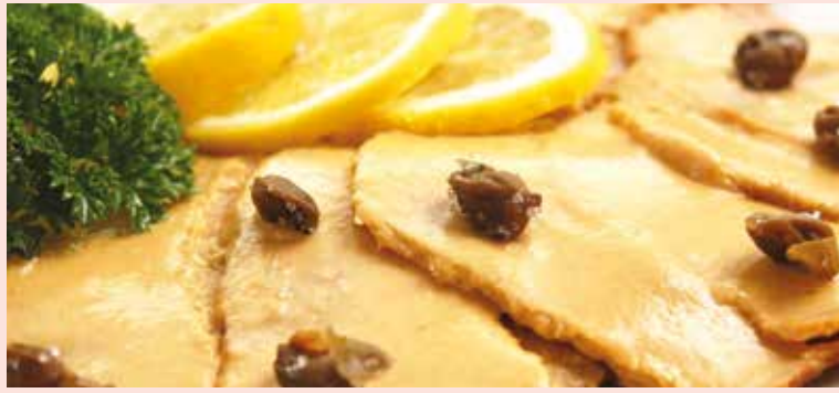
Family Pack Boneless Pork Cutlets..... $179 lb.