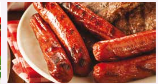
Natural Casing Kirschner Franks..... $499 lb.