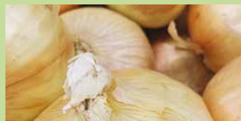
Mayan Sweets Sweet Onions..... 99¢ lb.