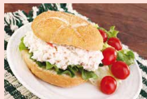
Prepared Seafood Salad..... $599 lb.