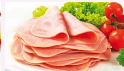
Deli Sliced Kayem Honey Ham..... $599 lb.