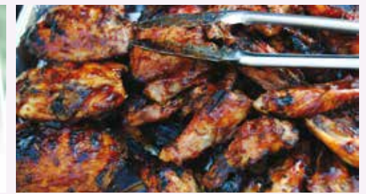
Family Pack Fresh Chicken Thighs..... 89¢ lb.