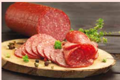
Deli Sliced Carando Genoa or Hard Salami ..... $499 lb.