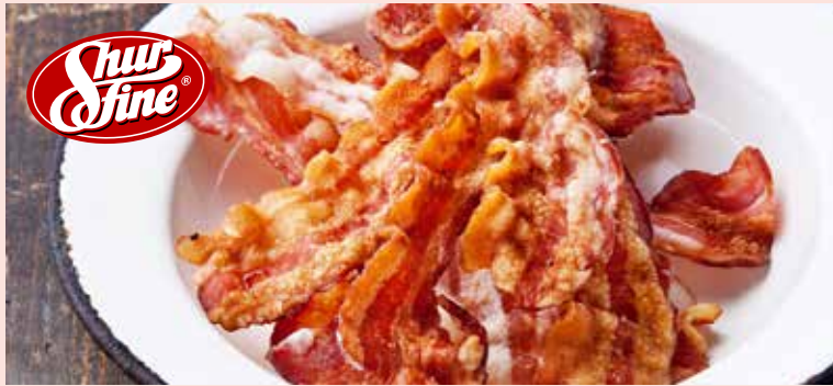
16 oz. Pkg. Shurfine Bacon ..... $449