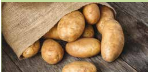
5 lb. Pkg. Russet Potatoes..... $299