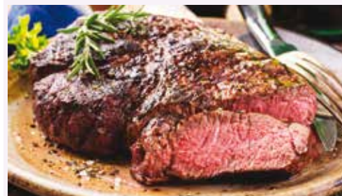
USDA Select Beef Boneless Top Round Steaks ..... $299 lb.